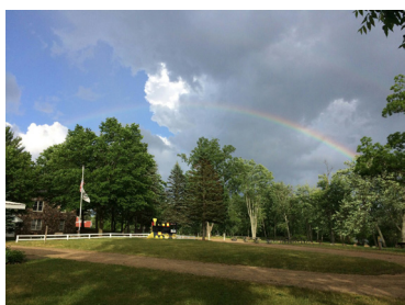
Rainbow near the Museum